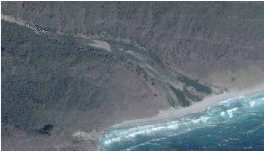
Satellite view of Wadi Sayq at Khor Kharfot, showing the large freshwater lagoon at the leading candidate for Bountiful, nearly due east from Nahom. Note: this Google Earth image was taken in the dryer winter months and thus lacks the vibrant green that follows the monsoon season.