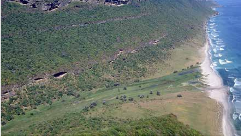
A view of Khor Kharfot at Wadi Sayq, facing eastward. Photo taken after the monsoon season when the area is especially green.

In contrast to Joseph's vague summary of Lehi's journey mentioned above, the Book of Mormon text provides a number of specific details: three days through the wilderness past the borders "nearer" the Red Sea to the Valley of Lemuel, which has a continuously flowing river, and