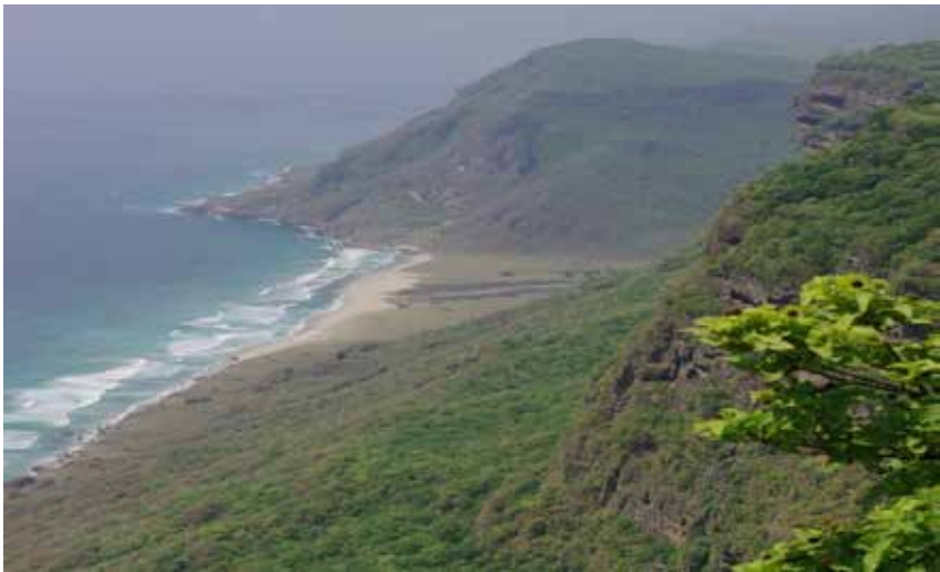
A view of Khor Kharfot, the mouth of Wadi Sayq, a leading candidate for Bountiful, with Arabia's largest freshwater lagoon and abundant fruit, nearly due east of Nahom.