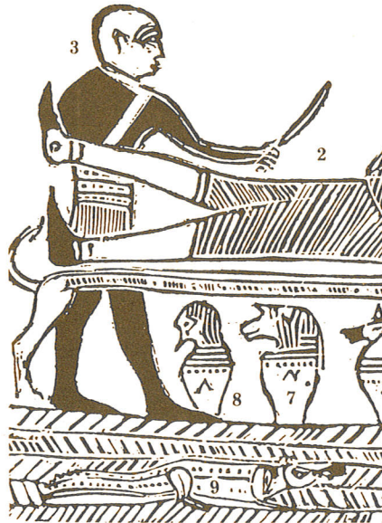
Detail of Facsimile 1 from the book of Abraham, showing the crocodile god

Though in Mercer's day scholars studied both Mesopotamian and Egyptian disciplines, they knew nothing of the interactions between the two cultures. In 1971, however, the Egyptologist Georges Posener completed a lengthy and detailed survey of the available evidence and concluded that cultural interactions and interference of Egypt in the area of Syria and Palestine were extensive, even though the precise nature of the "domination by the pharaohs" during the Middle Kingdom "still eludes us; fifty years ago it was barely suspected." 3 Yet some critics who