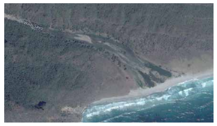
Satellite view of Wadi Sayq at Khor Kharfot, showing the large freshwater lagoon at the leading candidate for Bountiful, nearly due east from Nahom. Note: this Google Earth image was taken in the dryer winter months and thus lacks the vibrant green that follows the monsoon season.

A view of Khor Kharfot at Wadi Sayq, facing eastward. Photo taken after the monsoon season when the area is especially green.